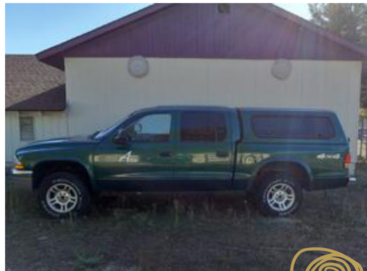
The pickups donated by Alta. The blue pickup is being moved by Nickerson's as we had to replace the batteries.