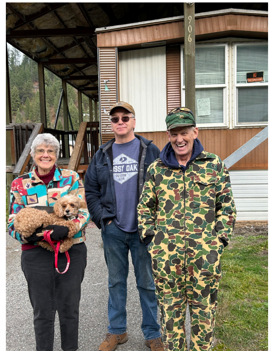
Everyone is so excited for Brain to be a homeowner!