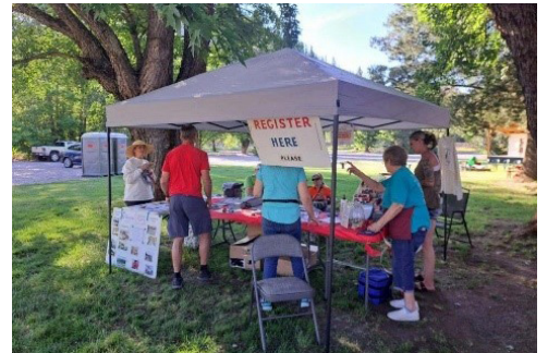
The group sets up under the awning donated by Ace Hardware.