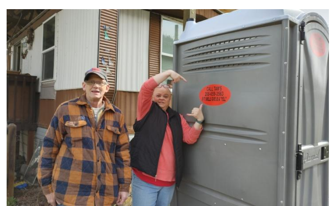
Tami wants to be sure we thank Tam's Traveling Toilets for donating the use of one during this cleanup day.