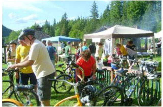
Bikers check their gear before “Riding The Wall”