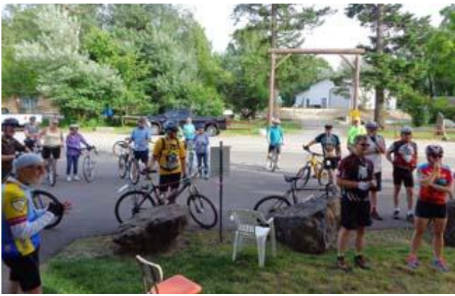
Bikers gather at the Mission Inn before the start of the Ride the Wall family bike event.