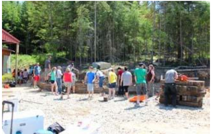
Here is a partial view of the worksite.