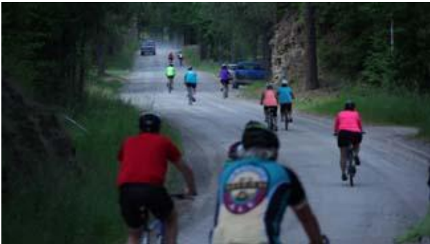
After crossing the bridge, the bikers travel on the CCC Road along the Coeur d'Alene River.