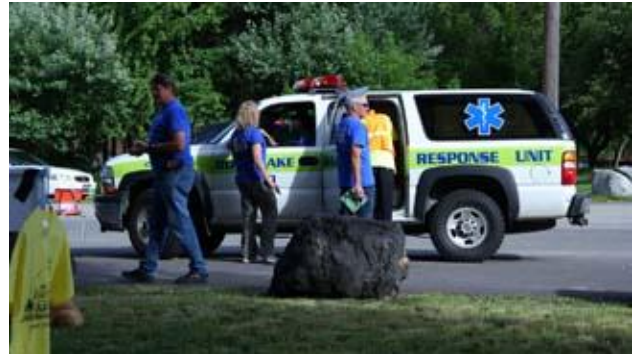
Rose Lake Quick Response Unit volunteers made sure all were safe.