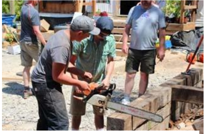
Under careful supervision, boys learn to use a chainsaw to cut the timbers used in the terraced area.

Prior to their service project, the HFCS 8 th graders spent their graduation weekend in the Silver Valley riding the Hiawatha Trail, swimming in the Mullan Pool, mining garnets near Fernwood, exploring Moon Pass, and playing at Silver Rapids. St. Alphonsus parish in Wallace