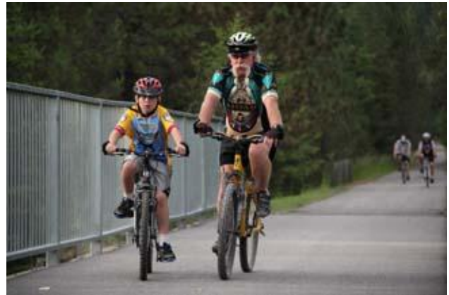
Riders came in many sizes and ages.