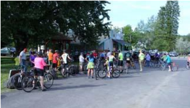
Bikers line up for the start signal.