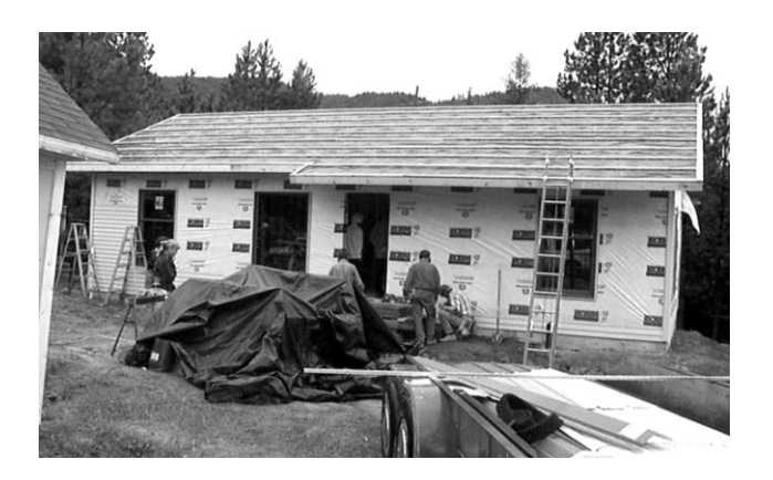
Two weeks work with many hands frame the home.