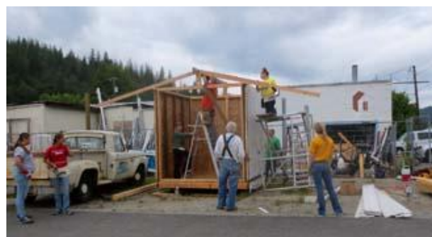
Idaho Servant Adventurers from Minnesota, stayed at the Shoshone Mountain Retreat and spent four days working on projects around our community. This group is learning some carpentry skills while building a shed that we can sell at the ReUse Store.