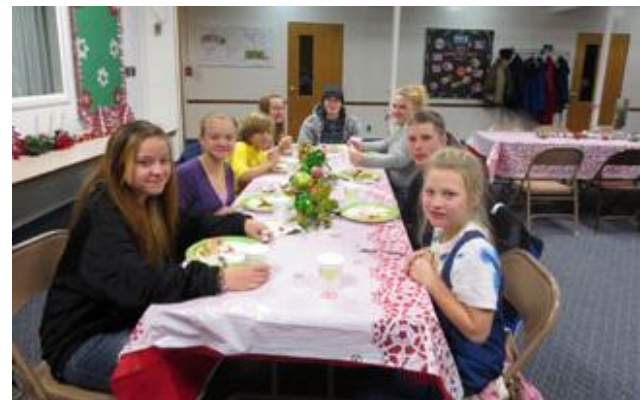
We were delighted to welcome the Mace family to our Christmas Potluck.