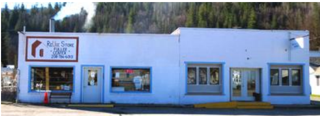
ReUse Store at 709 Main St. in Smeltonville with its new windows and doors.