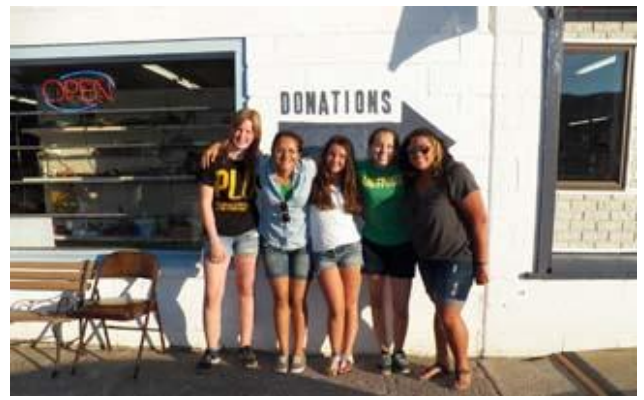
These girls with the Pilgrim Lutheran Church group from Puyallup, Washington became Sign Painters at the ReUse Store in August.