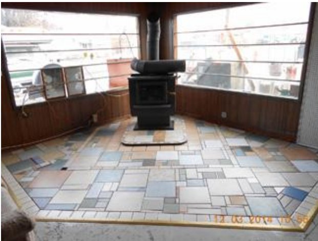
We were delighted when Kim Short decided to replace the shaggy carpet around the wood stove at the ReUse Store with tile. Her husband, Shorty, did help some even surviving catching the falling stove pipe on his head.