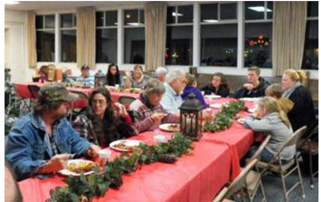
A nice group of well wishers came together to enjoy the dinner.