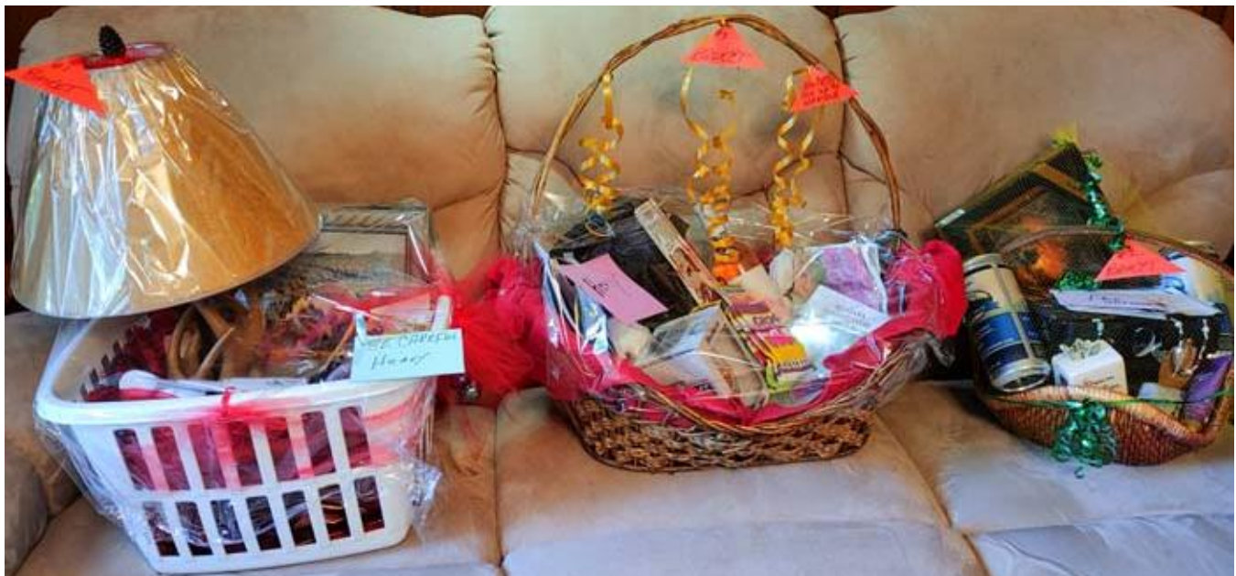
All Wrapped Up and Ready to Go—Baskets # 1, # 3, and # 2 For Our Silent Auction on line or phone only (see on page 3)