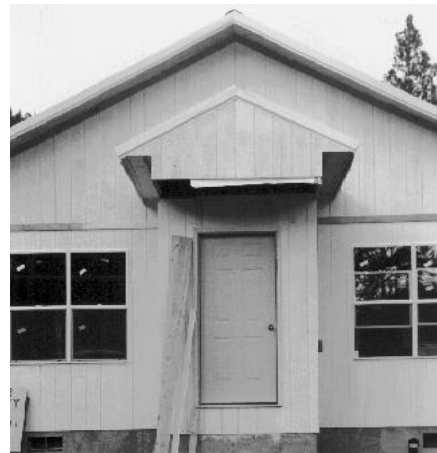
Copied from The Silver Bulletin, October 1995