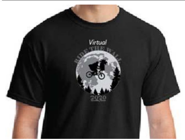
Virtual Ride the Wall Bike Event Shirt.