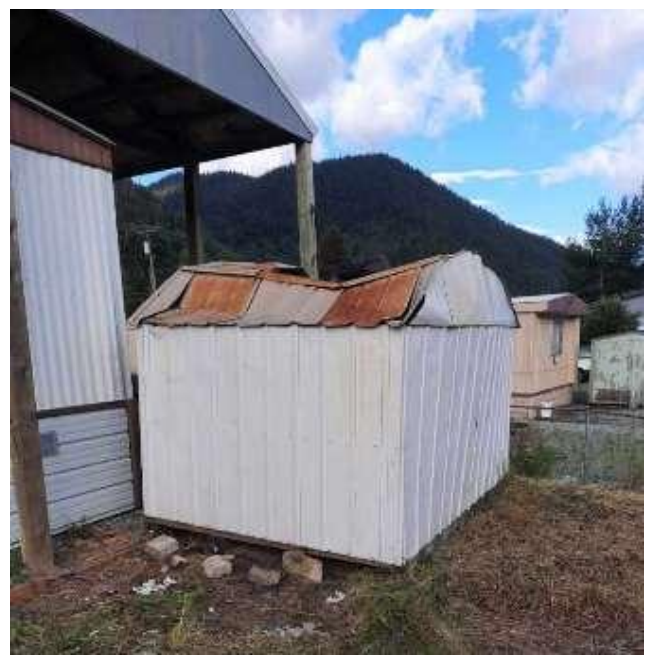
This shed behind the mobile home was crammed full of unusable items after snow had collapsed the roof. The shed has been dismantled and it and all the stuff inside have been hauled away.